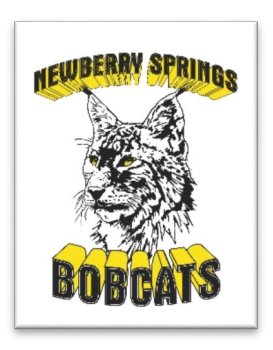
Newberry Springs Elementary School "Home of the Bobcats!"