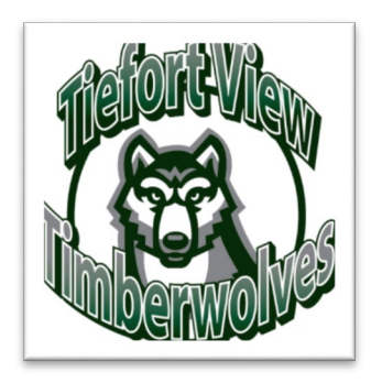
Tiefort View Intermediate School "Home of the Timberwolves!"