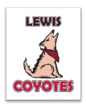
Lewis Elementary School "Home of the Coyotes!"