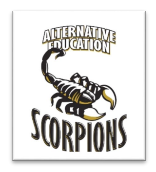
Alternative Education Center "Home of the Scorpions!"